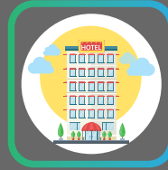
HOSPITALITY & HEALTH CARE