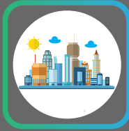
COMMERCIAL & RESIDENTIAL BUILDINGS