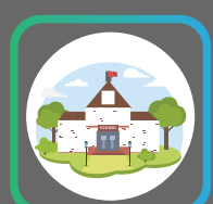
SCHOOLS / UNIVERSITIES