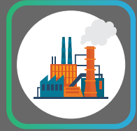
INDUSTRIAL - FACTORIES / PROCESSING PLANTS